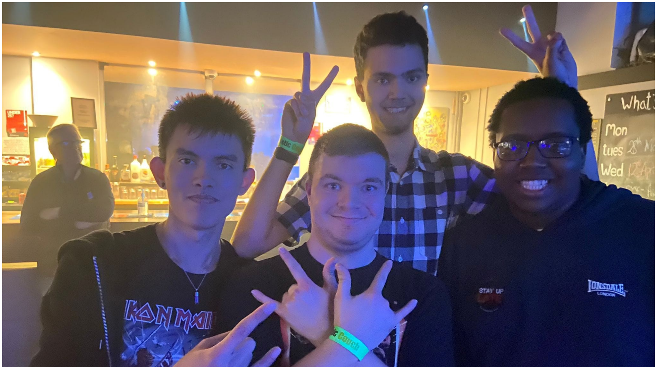
Taken at the Night Owls visit to the Acoustic Couch, Bracknell in March

Charity Name: The Ark Trust CIO Registered Charity Number: 1098204 Charity's principal address: TRAX, Mill Ride (off Fernbank Road), North Ascot, Berkshire, SL5 8JW